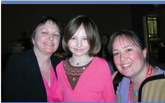
Portland, OR – Oregon Convention. Retailer jewelers representing the Oregon State Jewelers Association came together with the Make-A-Wish Foundation® of Portland and two chapters of CASA for Children during the associations' annual convention